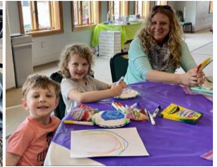
Easter Journey Adventure on Saturday, March 28 in the Ark