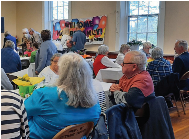
PRIME TIMERS EVENT AT ROCK SCHOOL HOUSE ON APRIL 24, 2024